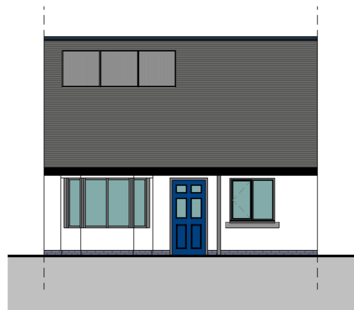
MID TERRACE FRONT ELEVATION 1 : 100