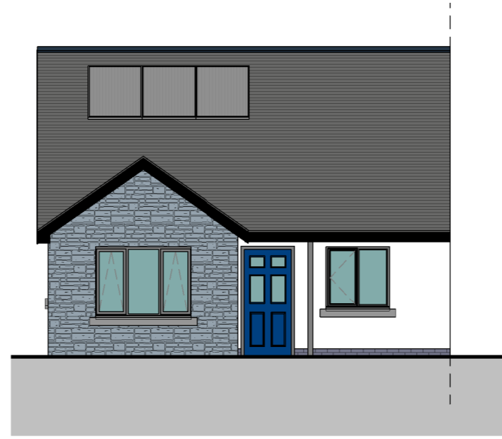
END TERRACE FRONT ELEVATION 1 : 100