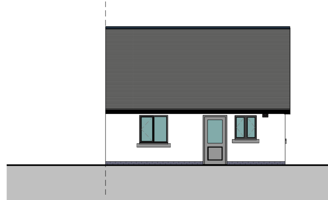
END TERRACE BACK ELEVATION 1 : 100